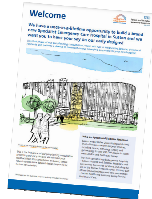
Front cover of the consultation brochure which was sent to 4,500 households closest to the Sutton site

• We hope to share our updated plans with you later this year before we submit a planning application.